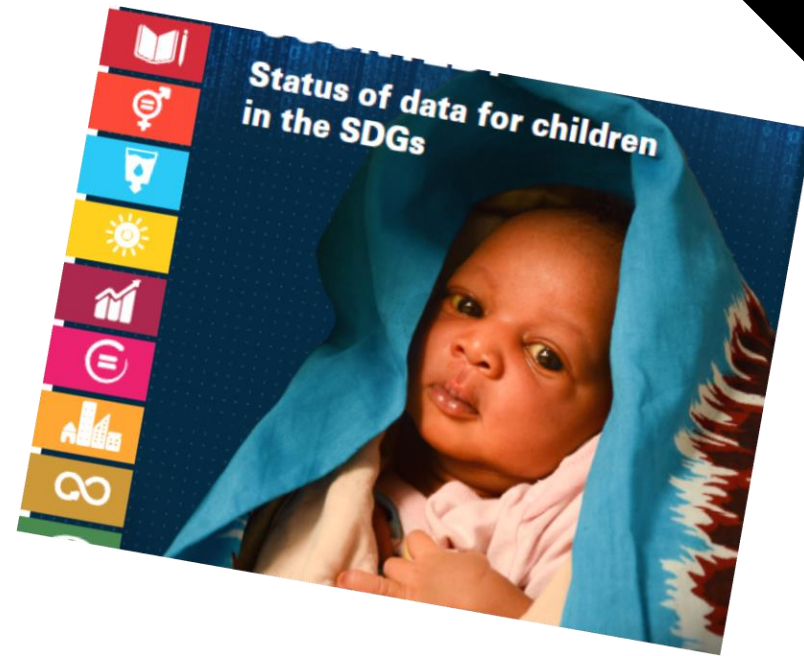
Every child survives and thrives